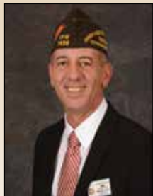
Bio on Page 9