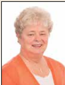
Bio on Page 9