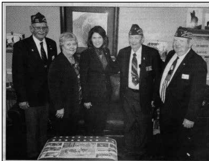
A meeting with Representative Kristi Noem ...

Earlier this week a South Dakota delegation for the Veterans of Foreign Wars paid a visit to Representative Kristi Noem while visiting the nation's capitol.