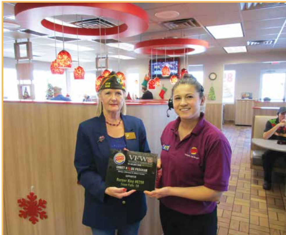
VFW Post participants: Watertown Post 750; Sioux Falls, Post 628; Huron Post 1776; Mitchell Post 2750 and Yankton Post 791.